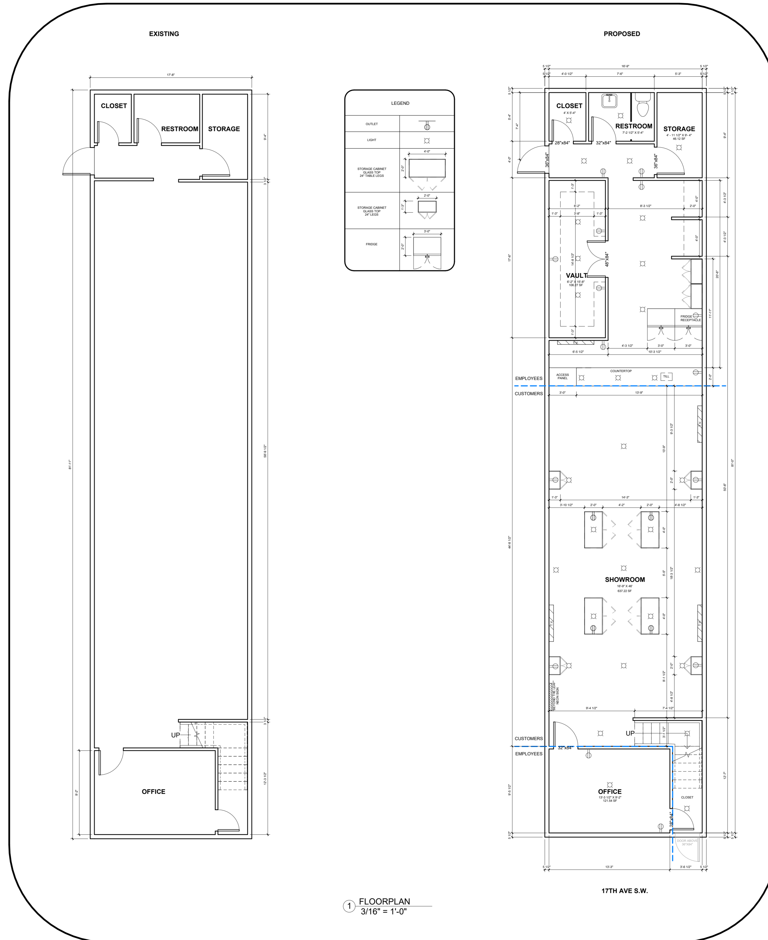
1 FLOORPLAN 3/16" = 1'-0"